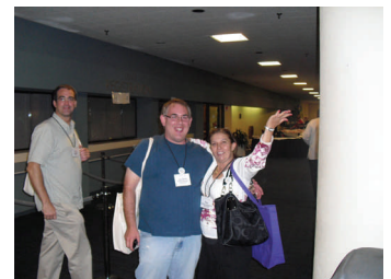
QCC Participants on the move