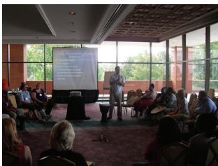
JHH Drumming Circle

country who were curious about our unique partnership approach to person-centered care.