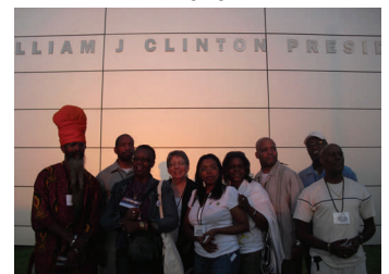
Visiting the Clinton presidential library